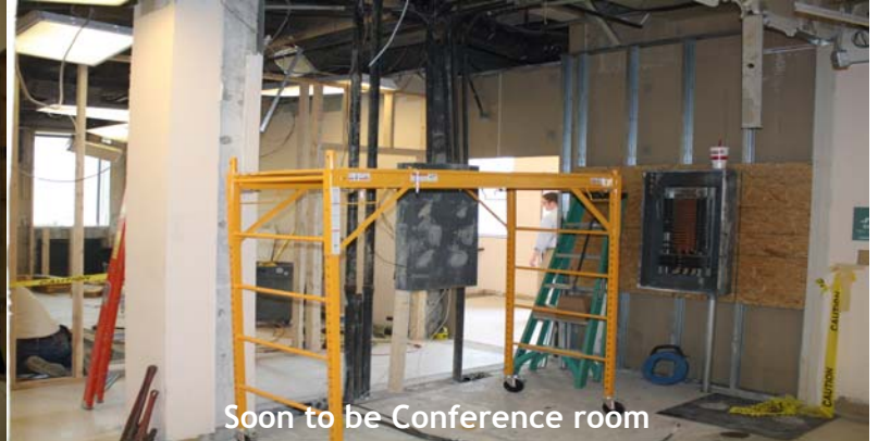
Soon to be Conference room